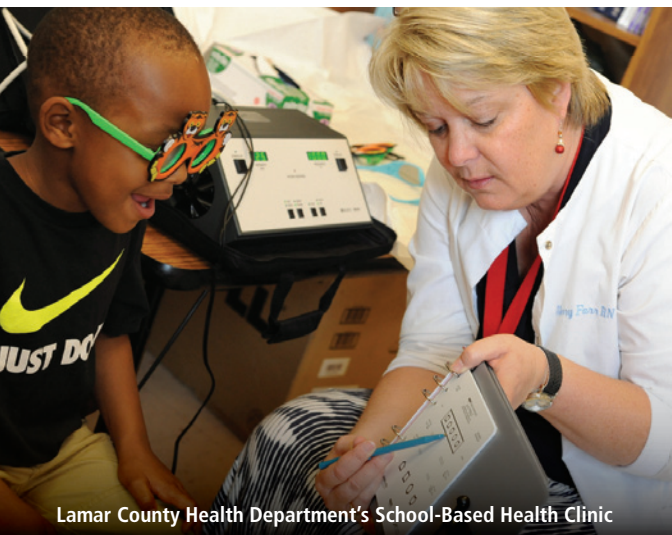
Lamar County Health Department's School-Based Health Clinic

We can help. It happens all the time at the Barnesville-Lamar Community Foundation. We make charitable giving easy and help you support your favorite causes and nonprofit organizations. You can create your own Donor Advised Fund at the Barnesville-Lamar Community Foundation.